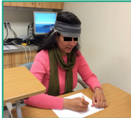
A functional near-infrared spectroscopy band monitors activation of the prefrontal cortex at rest and during the participant's engagement in coloring, doodling, and free drawing (printed with permission)